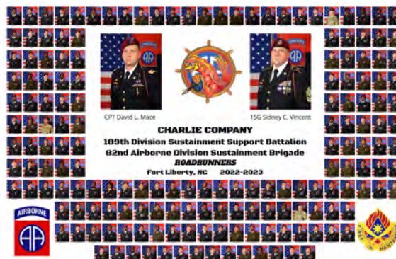
Optional Company Composite GPC approved purchase